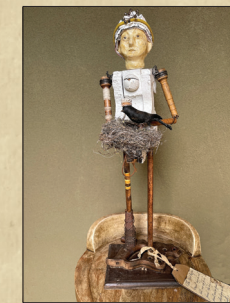
Liz Moores Sculpture & Mixed Media