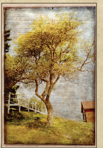
Mary Dereske Gilded Photography on Vellum